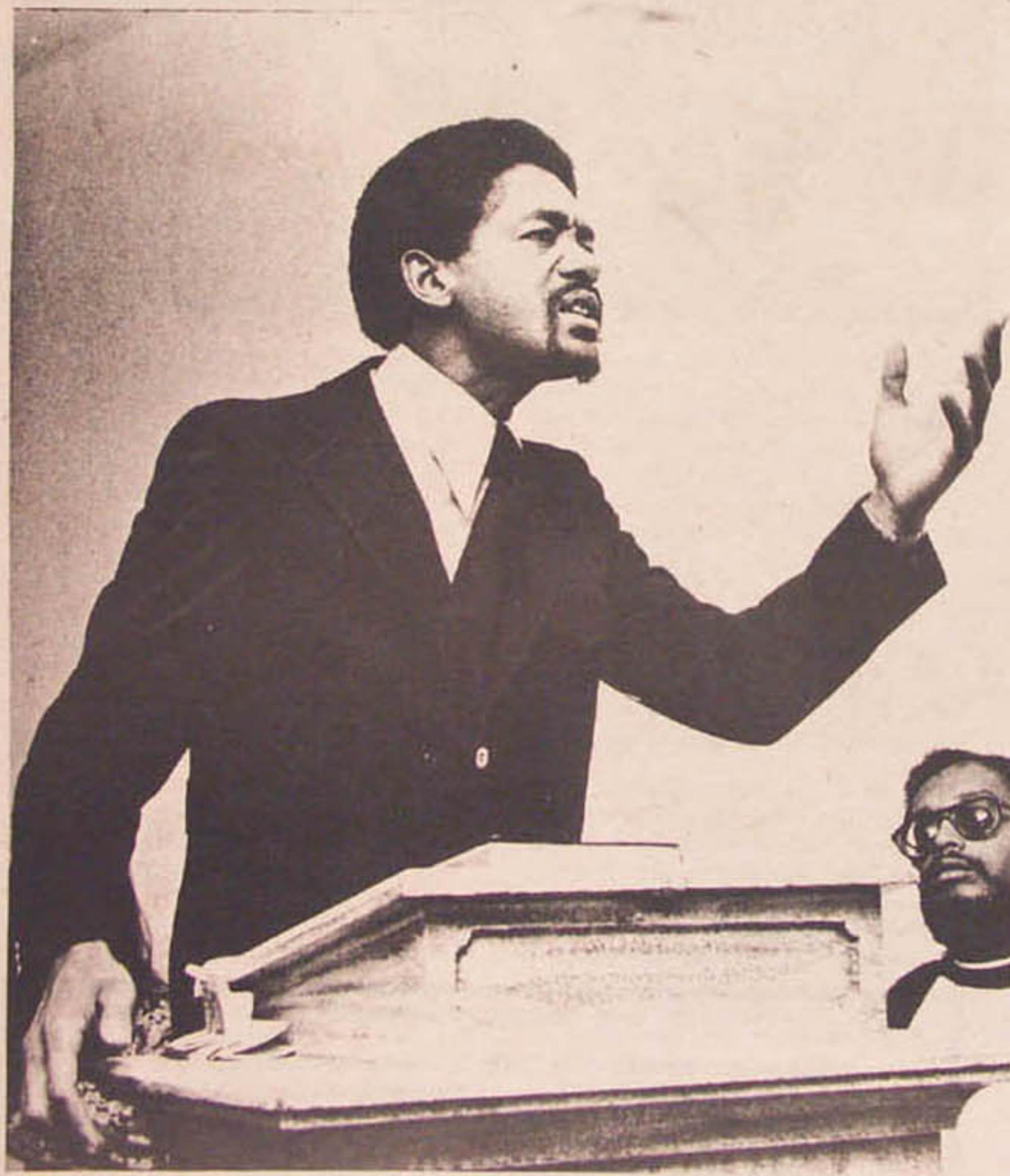
COMRADE BOBBY SEALE: "...Let's get to the pusher, the real pusher, Nixon and his regime... they are the real criminals!"